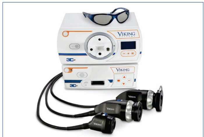
[Table/Fig-5]: Viking 3D setup

With the use of advance 3D laparoscopic system, the limitations of 2D laparoscopy can be overcome. Imaging in 3D system is obtained by either a dual-lens system or a single-lens system [6]. In dual-lens system, which was employed in our study, two separate lenses are present within a single laparoscope along with two cameras. Each camera captures their respective images, which are then displayed and synchronized on either a head-mounted display (active system) or a video monitor (passive system) [Table/Fig-5]. In the present study, a variety of cases were selected to assess the performance of 3D technology. In cholecystectomy procedures, anatomy of Calot's triangle and identification of cystic duct and artery was very well appreciated as compared to 2D imaging. This can aid in minimising the margin of error during laparoscopic cholecystectomy. The only